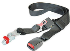
Shoulder belt with track fitting