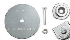
Quick connect fitting kit